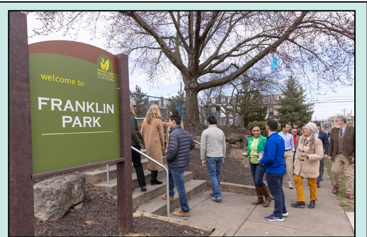
Fellows, partners and members of LPPIH visit Franklin Park for a walk throughout Census Tract 20 in Allentown

At the Leonard Parker Pool Institute for Health, we believe that health improvement happens through meaningful cross-sector collaboration within a specific geographic place. By investing in vital conditions (the factors outside of healthcare that impact health)